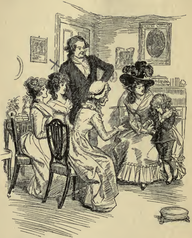
So shy before company.